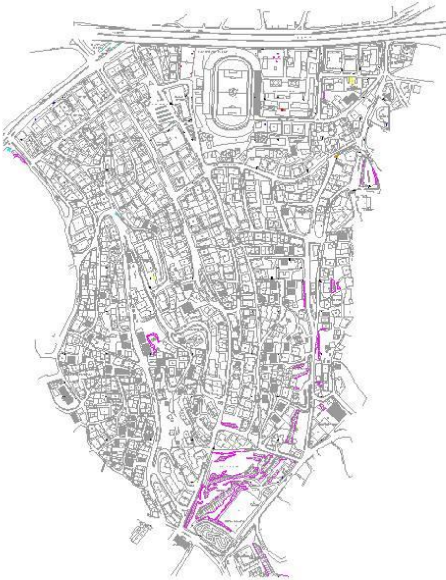
Figure 1 : Fulya Quarter

A map is designed in the project for the billboards in Fulya for inquiring of an address inside the quarter boundaries (Figure 2 ). AutoCAD2010 and Macromedia Flash MX2004 software are used for this process. The vector data of the quarter is converted to .wmf file in AutoCAD software and Flash Macromedia MX2004 software is used for designing the end map.