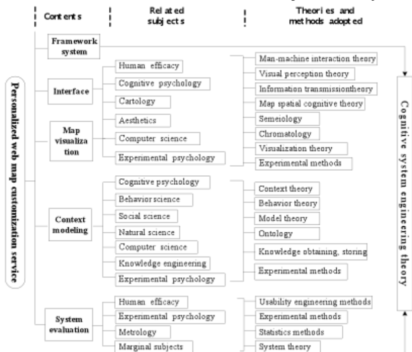
Fig.1 Theory framework of personalized web map customization service

Because of its complex framework, rich contents and widely application, personalized web map customization service involves multitudinous disciplines and subjects as shown in Fig. 1.