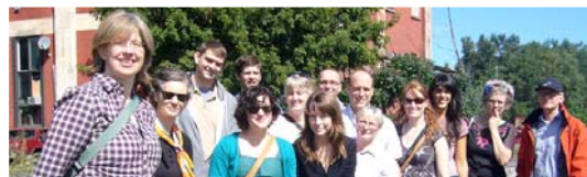
Happy participants of the workshop in Montréal (Sept. 2010)

September 2010. Workshop. "Mapping" Environmental Issues in the City: Arts and Cartographic Cross Perspectives. Concordia University, Montréal. 16 artists, cartographers, designers, and media practitioners internationally have developed their own mapping project in response to a given database ( http://mappingworkshop.wordpress.com ).