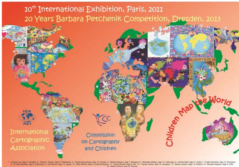
Poster commemorating the 10 th Barbara Petchenik Exhibition (Paris, 2011) and the 20 th Anniversary of the Competition (Dresden, 2013)

Membership - 55 members from 25 countries, including Brazil (7), Argentina (5), Greece (5), Spain (4)