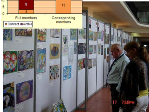
Barbara Petchenik Exhibition 2009 (Santiago de Chile)