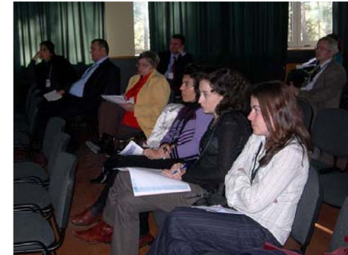
Commission Meeting during the 2 nd Conference on Cartography and GIS (Borovets, Bulgaria, 2008)

Before the ICC 2011 the Commission collaborated in the organization of a Joint ICA Symposium of four Commissions and a Working Group (Cartography and Children, Education and Training, Maps and Internet, Planetary Cartography and Cartography on EW-CM) at the University of Orleans (30 June - 1 July, 2011). A selection of papers presented in this event (under the title of „Maps for the future: Children, Education and Internet” ) will be published by Springer Verlag next November.