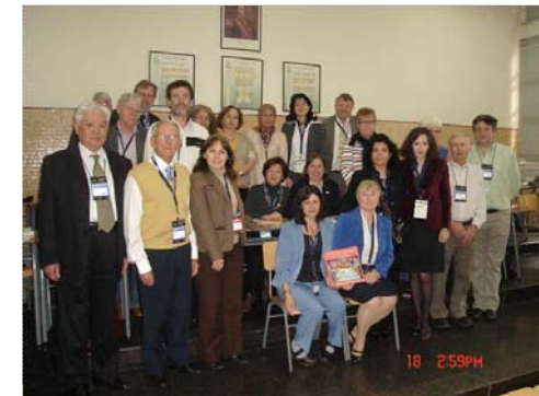
Commission Meeting during ICC 2009 (Santiago de Chile)