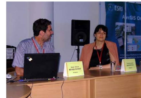
Commission Meeting during the 3 rd Conference on Cartography and GIS (Nessebar, Bulgaria, 2010)