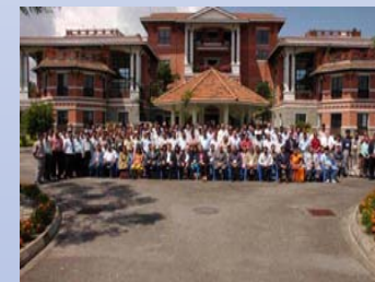
Group photograph of the participants of the 10th International Symposium on High Mountain Remote Sensing Cartography 11-Sep-2008, ICIMOD, Kathmandu

Website www.terrainmodels.com : History and tutorial covering the art and techniques of terrain modelling