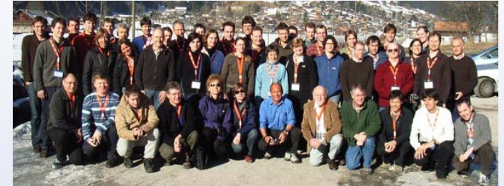
Participants at 6th Mountain Cartography Workshop, Lenk, Switzerland, 11th-15th February 2008