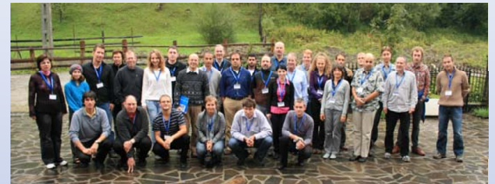
Participants at 7th ICA Mountain Cartography Workshop, Borsa – Maramures, Romania September 1 - 5, 2010