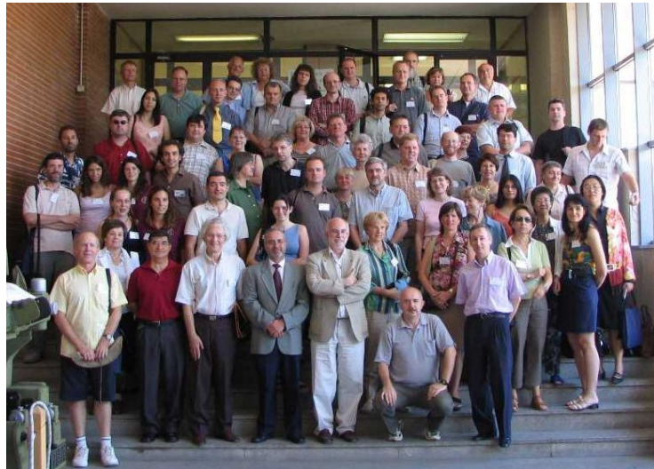
Figure 5. Joint Commissions meeting, Madrid, 2005.

The joint seminar attracted a large participation group, who are pictured in figure 5.