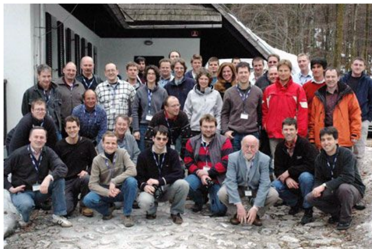
Figure 6. Mountain Cartography Commission workshop, Slovenia, 2006 http://www.mountaincartography.org/ . Used with permission.

Commission meetings also take place in more exotic locations. Take for example the meetings of the High Mountain Cartography Commission, who meet regularly in alpine areas. Figure 6 shows their recent workshop in Slovenia in 2006.