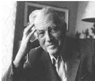
Figure 1. First president of the ICA, Professor Eduard Imhof.

The ICA was founded on June 9, 1959, in Bern, Switzerland. This occurred after a number of preparatory conferences were held 1956 - 1959, where its foundation was discussed. In 1961 the first General Assembly (I) was held in Paris. The first President was Professor Eduard Imhof, of Switzerland (ETH, 2006), who held this position between 1961 and 1964.