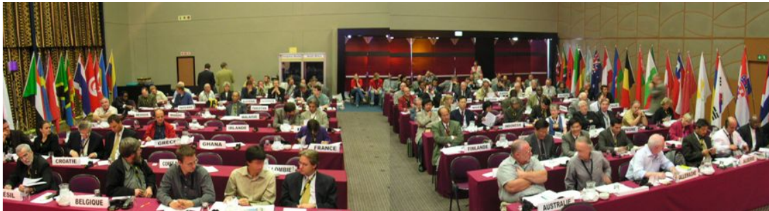
Figure 1. ICA General Assembly, Durban, South Africa, 2003.

Also at the General Assembly the ICA's Commissions and Working Groups' chairs and vice-chairs are elected and their terms of reference for the following four years are approved. On some occasions extraordinary General Assemblies are held to debate and decide on pressing matters. The photograph in figure 1 show national representatives at the General Assembly held in Durban, South Africa in 2003.