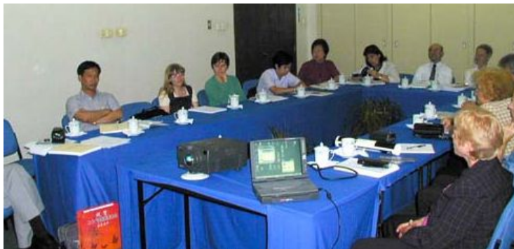
Figure 4. Commission on Education and Training, Berlin 2006