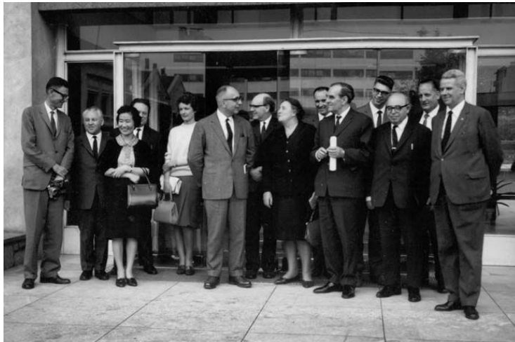
Figure 3. Commission on Education in Cartography 1966

Commission meetings have always been an integral part of the way that the ICA operates. Take for example the Education Commission's meeting in Budapest in 1966 (figure 3) and its recent meeting, 40 years later, in Berlin in 2006 (figure 4). It is through continued efforts like this that the ICA advances cartography.