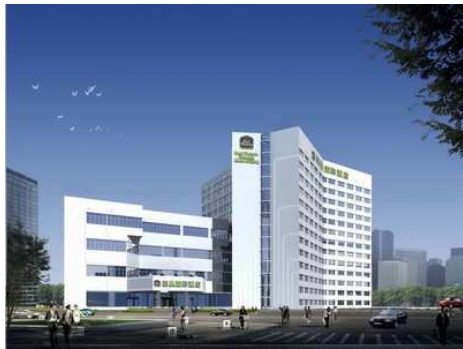
A. Best Western OL Stadium Hotel Beijing, A1, Datun road, Chaoyang district, Beijing