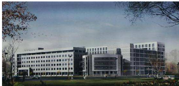
B. Institute of Geographical Science and Natural Resources Research (IGSNRR), Chinese Academy of Sciences (CAS)