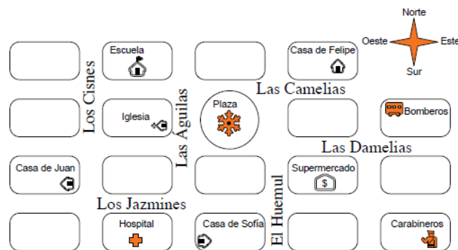
Figure 1. City map: different buildings as public and private places.

Examples of students' worksheet . The task: The students received a city map showing different buildings, as well as public and private places (people's home). The map included a compass card. Afterwards they had to for answer four questions. In two questions they had to locate different elements in the map using cardinal points and relative points of reference. The third question described a route, and then students had to explain where the route led to. Finally, in the fourth question, students had to give instructions to move from one place to another.