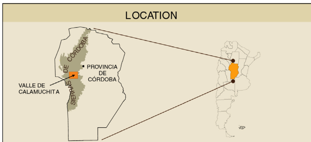
Fig 1: Area of work.

On the basis of the geological sheet 3166-36- in the Calamuchita’s Valley (Gaido et al. , 2006 y Gaido, M.F., 2006), one of the main touristic area in the province of Cordoba (Fig. 1) which also includes important sites of geological interest, arose the initiative to develop a cartographic product according to the new geotouristic demands. This new product should stand out and link the main touristic circuits with the sites of geological interest (georesources), on a simplified geological basis of easy reading and understanding (geodiversity).