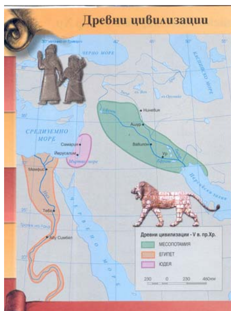
Figure 2. Ancient civilizations mapped in history atlases for school year 5.

The atlas “History and civilization” (32 pages, sizes 31x24 cm, published in 2007) for school year 6 (ages 12-13, respectively) contains 38 maps. The topics are represented in four chapters: Revival period of Bulgaria; Leaders of the Bulgarian National Revival, Bulgaria to middle of XX c. and Bulgaria after Second World War.