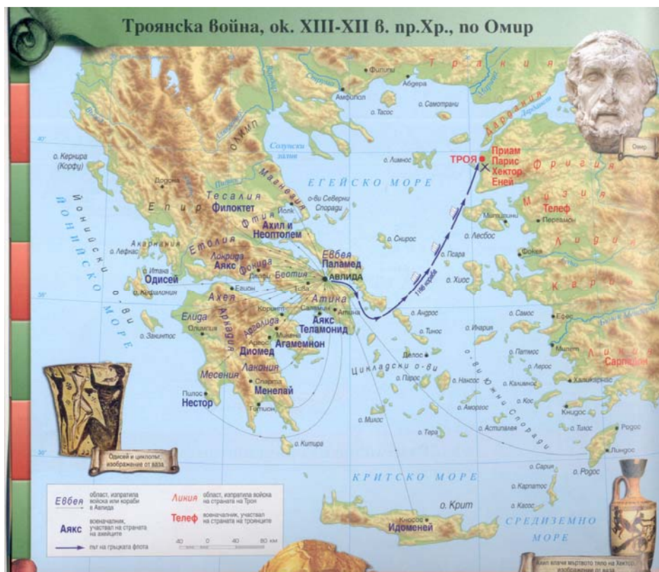
Figure 5. A map for the Trojan War published in the Historical Atlas for school year 7.

Other new idea for atlas compiling is connected to representation of specific themes in the Atlases. Such theme is the Trojan War which is not represented in any atlas or encyclopaedia. It is mapped according to information taken from the Homer's poem "Iliad". The result could be seen on Figure 5.