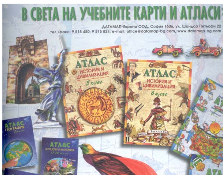
Figure 1. Some covers of educational Atlases in a Poster

We are living in a time of rich information society in a global world with many communication possibilities. Cartography is developing incredibly in the technology aspect. Old paper version products started to be not enough attractive to students. The tasks of cartographers have to find a closer way of communication with students in historical lessons and this could be achieved by quality information representation and attractiveness of cartographic products. In some studies we can find that the communicative map quality means the effectiveness to what extent the information transfer occurs. And all this could be a part of the total quality of a map with communication purposes. Also some authors speak about another aspect of cartographic quality as attractiveness of the map (Vansteenvoort Liesbeth, De Maeyer Philippe, 2005). Combining all these tasks and using curriculum in history, as well as a new design and high quality printing it is achieved the great students' and teachers' interest