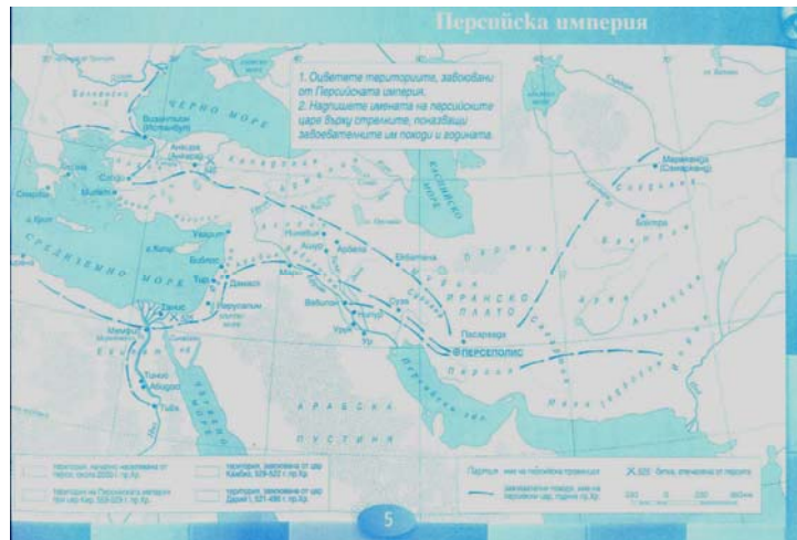
Figure 4. A blind outline map for Persian Imperia for school year 7.

The atlas “History and civilization” (32 pages, sizes 31x24 cm, published in 2008) for school year 7 (ages 13-14, respectively) contains 50 maps. The topics are connected with dynamic societies in prehistory and ancient world for the period IV millennium B.C. – V c. The maps are divided in the following chapters: Prehistory; Ancient East; Ancient Greece, Ancient Roma. Geographic Information System, computer generated shade relief, modern design and high quality paper publishing are used for map and atlas compiling. A page from the atlas representation can be seen on Figure 3.