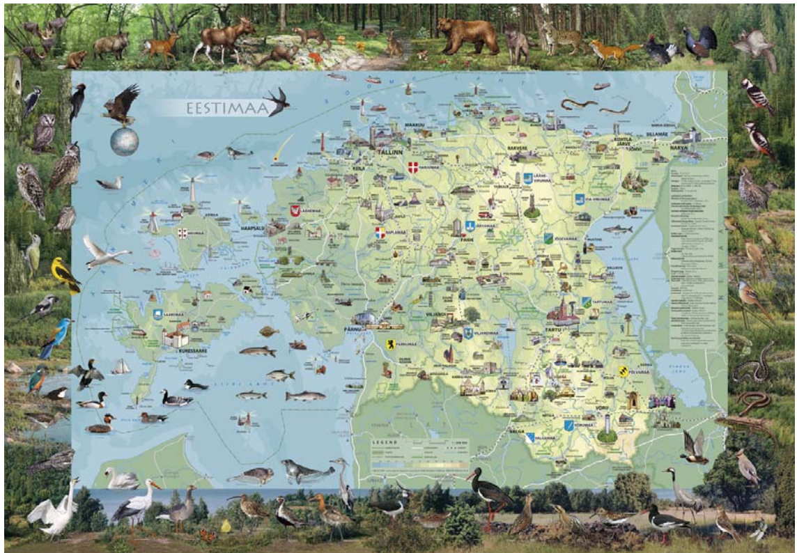
Regio's illustrated wall map of Estonia in 2009