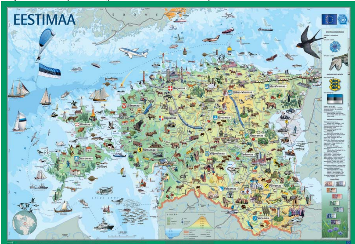
Regio's illustrated wall map of Estonia in 2001

In 2009 we produced a new version of this wall map and this time main stress was laid on Estonian nature. Due to special map frame the map scale is smaller and there are only the most important objects of Estonia on the map.