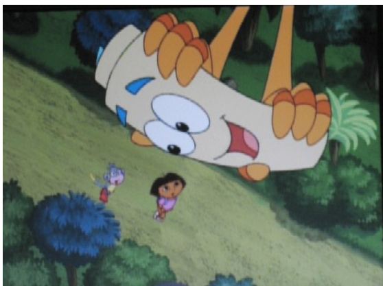
Figure 3 -- As Map is carried away by a bird, he tells Dora she should make her own map to find him. From Lost Map episode.

In the episode ‘Lost Map’ the character Map is captured by a goofy bird to be used to line his nest. As Map is carried aloft he tells Dora to make her own map to find him. She turns to her backpack to get paper and marker and sketches the route, passing by the butterfly garden and the corn field. After everyone gets to the mountain and Map is back, Dora shows him the map she made. We see her map close-up and Map praises her for her map. This act of Dora drawing her own map has to be a big step in demonstrating that a diagram can represent a larger world. Figure 4 illustrates this very well. This episode is quite popular and is the main entry on the DVD entitled ‘Map Adventure’ (Nickelodeon, 2003). In addition in this episode viewers see two maps on signs to help them get through the butterfly garden and the cornfield.