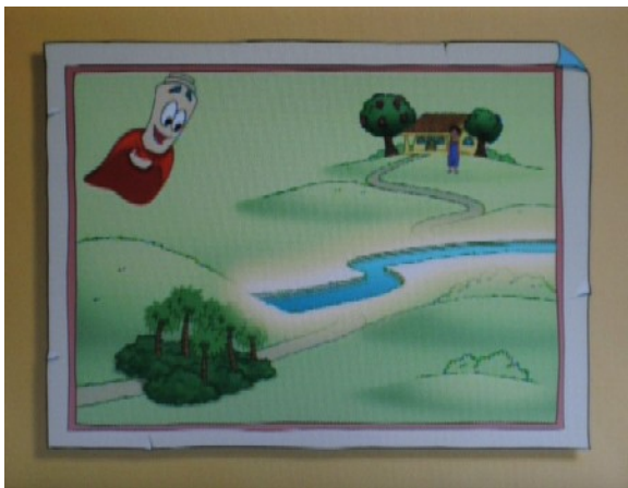
Figure 1 -- Map becomes Super Map when donning the red cape. Here the river is highlighted as Map leads viewers through the route to follow to get to Dora’s house. From the Super Map episode.

As children continue to shout his name, Map jumps out of the backpack and emerges on a colorful map on the screen singing his signature song: Figures 1 and 2 “If there’s a place you gotta go, I’m the one you need to know. I’m the map, I’m the map, I’m the map, I’m the map.”