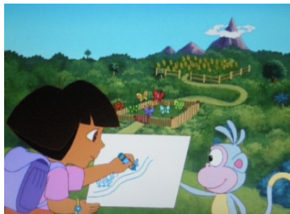
Figure 4 – Dora sketches her own map to determine how to get to Tallest Mountain to rescue Map. From Lost Map episode.