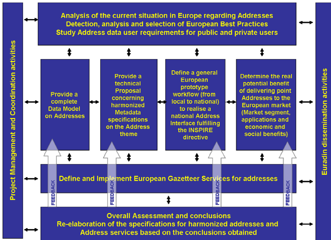
Figure 1: Interrelationships between areas of work

The interrelationships between the different areas of work are presented below: