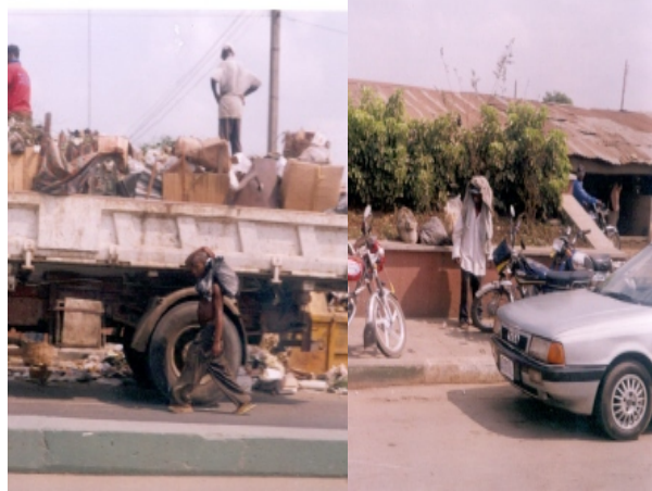
Lunatics photo plates no. 5-8

Uyo Urban Zone Six: This is a zone most paraded by the lunatics. They move about at traffic close-up, plazas, verandas of public offices, along the streets; sitting at road pavements and motor park etc. doing one type of action and the other. The lunatic in photo plate number 9 is very peculiar in his own way. He is seated on a heap of stones with a knife in his raised hand and fragment of food in his left hand while photo plate numbers 10 and 11 showed two of them walking along the major roads leading to the city plaza, whereas photo plate number 12 is a female lunatic sitting on a pavement close to a public building.