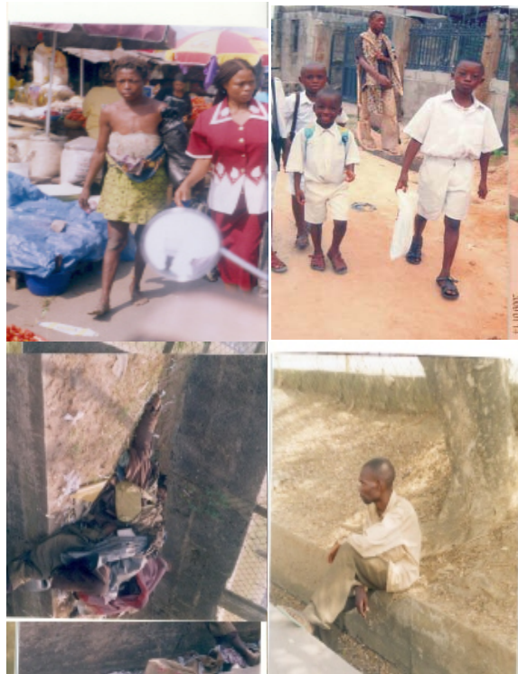
Lunatics photo plates no. 1-4

meters from him on a drainage pavement is the one whose insanity hasn't been long, see photo plate number 4.