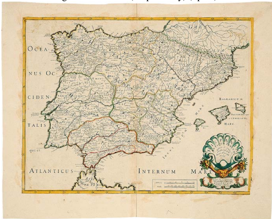
Figure 3. “Hispaniae Antiquae Tabulae”, 1641. Signatura IGNC 11-F-14.