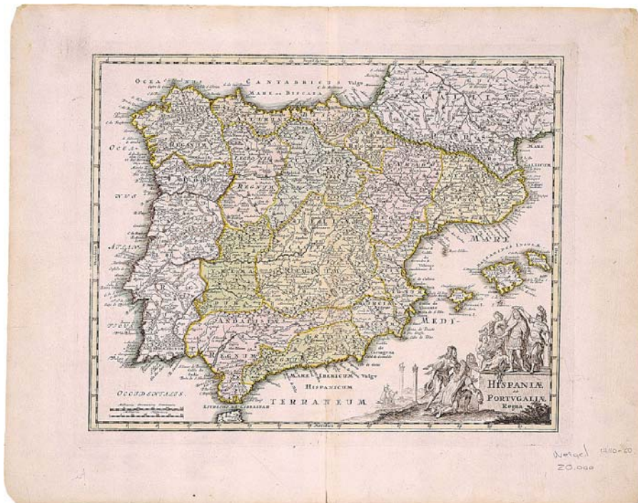
Figure 4. “Hispaniae et Portugaliae Regna”, Johann Cristoph Weigel. Nuremberg, 1740-60. Signatura IGNC 11-F-21. © Instituto Geográfico Nacional (Map Library) (Spain).

© Instituto Geográfico Nacional (Map Library) (Spain).