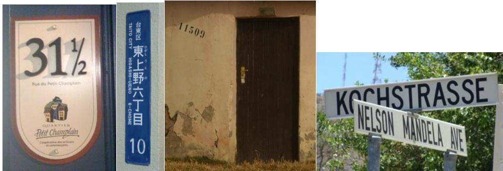
Figure 1. Address examples, from left to right: Quebec, Canada; Tsukuba, Japan; Mthatha, South Africa; Windhoek, Namibia.

Many stakeholders are involved in both designing and maintaining an addressing scheme, including: town planners who assign addresses when an area is first developed or formalized; authorities who install and maintain place and street name signs; local authorities and/or utility companies who use the address when providing services and billing for them; postal operators who deliver mail to an address; and addressees, who can correct errors in their addresses. In fact, any user of an address is a potential provider of address corrections and thus a stakeholder in the addressing scheme.