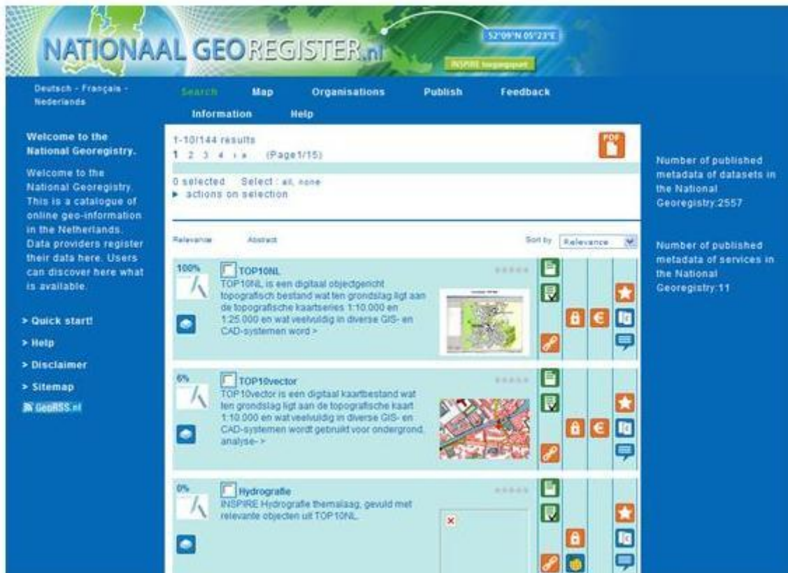
Figure 6 Information about the datasets completed with icons