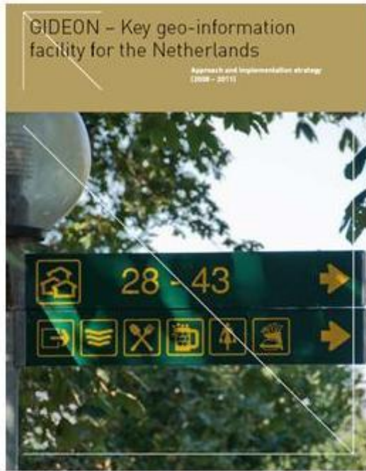
Figure 2 The Gideon report