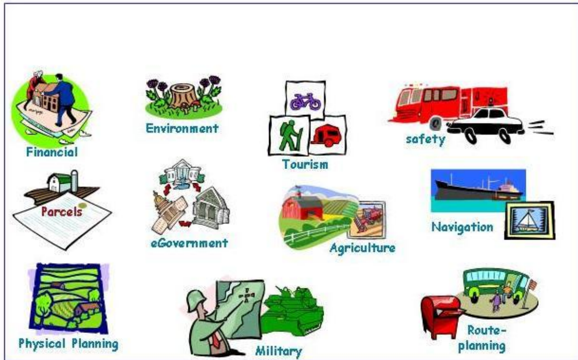
Figure 1 The geo-information market

Therefore, geo-information has a prominent place in governmental public services as it reduces administrative burdens on the public and industry. The Dutch Government has produced an implementation strategy for geo-information in The Netherlands, known as Gideon. The Gideon document explains how public sector parties have created a key geo-information facility enabling them to be responsible for managing and using spatial information for the Netherlands. The objective is to achieve optimum utilization of geo-information by public authorities, business and citizens in the Netherlands.