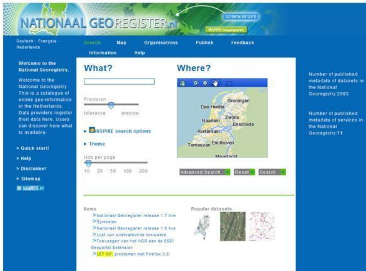
Figure 5 The screen of the national georegistry

Governmental organisations such as ministries, provinces, water boards, and municipalities will share data for general use, and combine it with their own data and for different applications. Also datasets which will become available for the INSPIRE Directive, can be found via this portal. Many data providers have published metadata in recent years on their data sets and services. At the beginning of 2011 more than 2600 datasets are listed (see figure 5). The National Georegistry provides the most comprehensive central list of public sector information. Initiatives such as the introduction of the European INSPIRE Directive and the programme “Mapping Service for the Public” (PDOK) give a further boost to the portal. INSPIRE helps the availability, quality, organisation, access to and exchange of geo-information in Europe. It also links The Netherlands national provision, the National Georegistry, to a European network. The PDOK ensures that the National Georegistry will further be developed and managed.