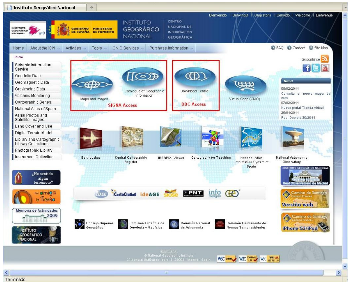
Figure 3: SIGNAWEB and DDC in the new IGN-CNIG web site. www.ign.es

SIGNAWEB and DDC hold a prominent position in the new IGN-CNIG web site as is shown on the figure bellow.