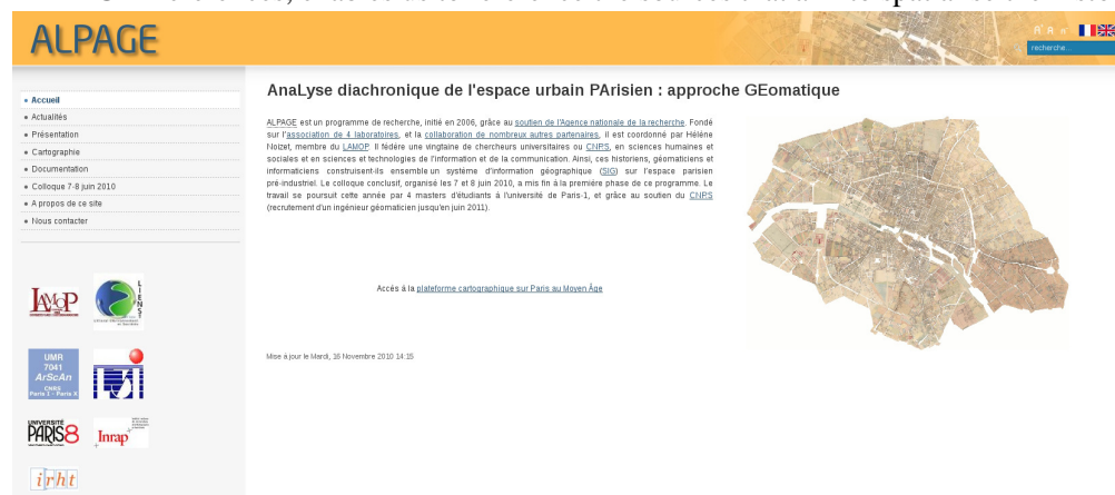
Figure 4. Website of the ALPAGE project.

From a technical point of view, this webmapping platform allows us to publish online new data, to manage metadata, and allows everyone to consult the published data. An online centralised database, entitled ALPAGE-References, enables us to reference the sources that aim to specialise the historical objects.