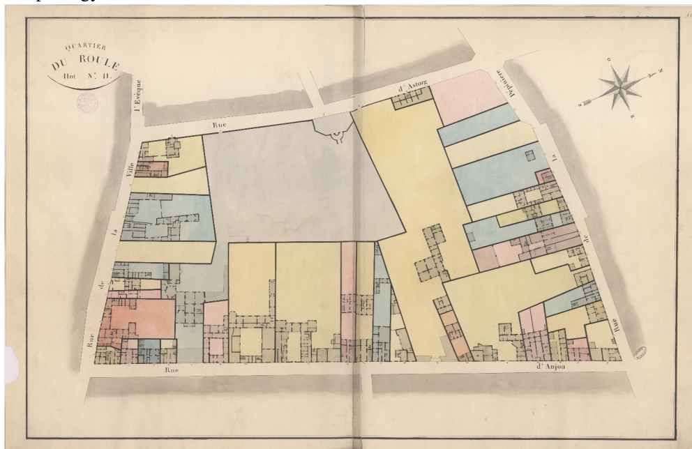
Figure 1. An example of a Vasserot's parcel plan.

In consideration of the growing interest in urban space studies, the ALPAGE project (ALPAGE is a French acronym for “diachronic analysis of the Paris urban area: a geomatics approach”) aims at producing data and tools to understand the long term relationships between spaces and societies in Paris. This project is a three year research program funded by the French National Research Agency. It involves the work of 4 laboratories with the collaboration of various partners, bringing together more than twenty researchers and academics from social and human sciences and from the computer science field. The main laboratories or institutions involved in this project are LAMOP (project leader), ArScAn, LIENSs, L3i, COGIT, IRHT, the Parisian topography centre, APUR. The above come together to collaborate on building a Geographic Information System (GIS) for the Parisian area in the pre-industrial period. The creation of such a GIS enables to reconstruct the oldest parcel plan of Paris, the Atlas made by Vasserot between 1810-1836 (an example of a parcel plan is shown in figure 1), and to spatialise historical data from the Middle Ages and modern times (walls, aristocratic mansions, sewers, floods, manors, parishes, etc.). When linked with the old urban fabrics, these data show the diachronic structure of the urban morphology.