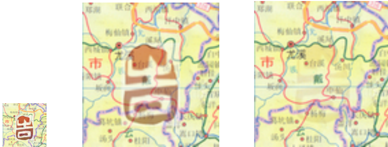
Fig. 4 The visible watermark in the maps with different visibility levels

The watermarked maps are shown in Figure 4, in which showed the visible watermark in the map with different visibility levels. In fact, the watermark can be presented in any visibility level.