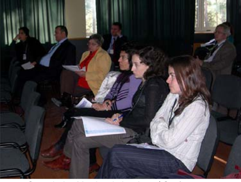
Commission Meeting during the 2<sup>nd</sup> Conference on Cartography and GIS (Borovets, Bulgaria, 2008)

Before the ICC 2011 the Commission collaborated in the organization of a Joint ICA Symposium of four Commissions and a Working Group (Cartography and Children, Education and Training. Maps and Internet, Planetary Cartography and Cartography on EW-CM) at the University of Orleans (30 June - 1 July, 2011) A selection of papers presented in this event (under the title of "Maps for the future: Children, Education and Internet") will be published by Springer Verlag next November.