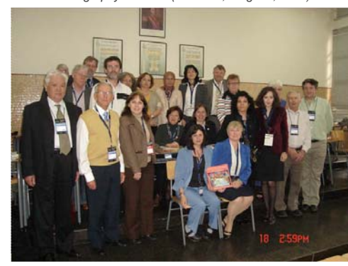
Commission Meeting during ICC 2009 (Santiago de Chile)