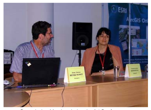
Commission Meeting during the 3<sup>rd</sup> Conference on Cartography and GIS (Nessebar, Bulgaria, 2010)