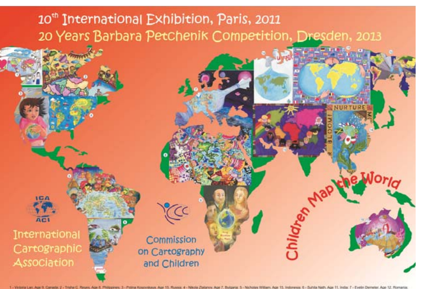
Poster conmemorating the 10<sup>th</sup> Barbara Petchenik Exhibition (Paris, 2011) and the 20<sup>th</sup> Anniversary of the Competition (Dresden, 2013)

Membership - 55 members from 25 countries, including Brazil (7), Argentina (5), Greece (5), Spain (4)