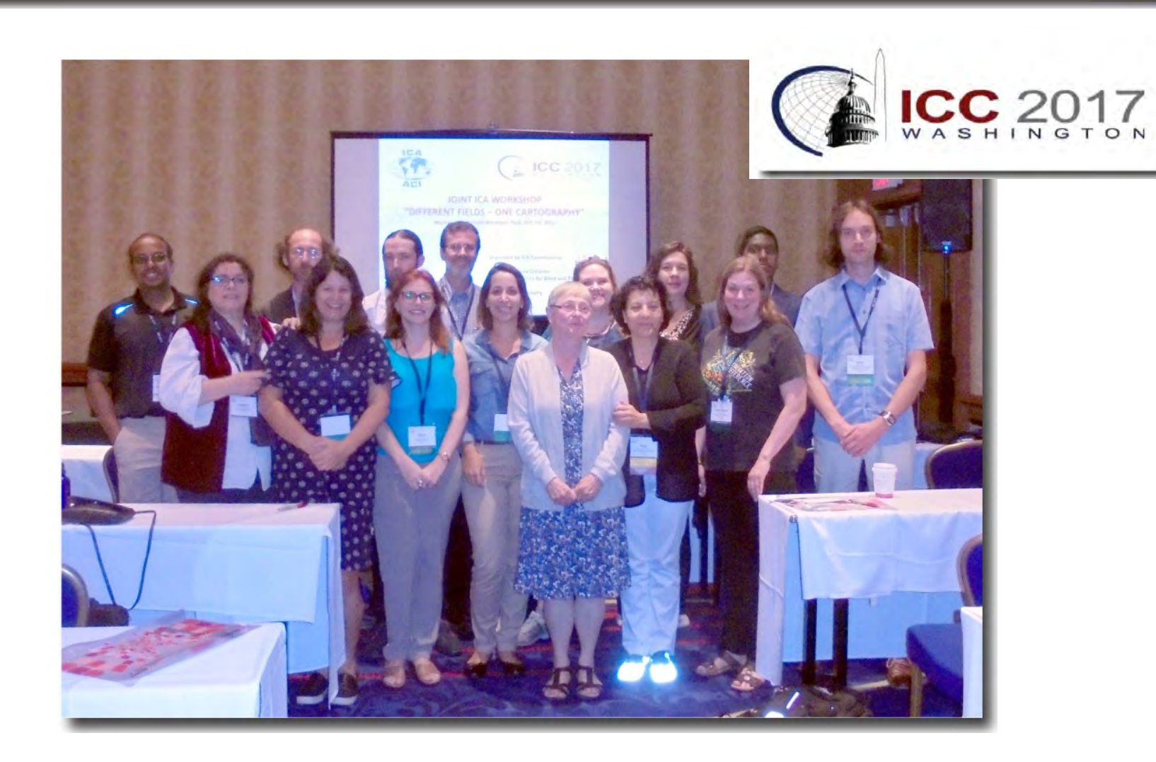
"Sharing knowledge" Joint ICA Symposium At ICC 2017, we collaborated with the commissions: Cartography and Children, Education and Training and Planetary Cartography on a pre-conference event.

The Commission relates to research and production of cartography that responds to the needs of people with sensory disabilities, learning problems, reduced mobility, senior adults, among others. This cartography may be made and take the shape of: tactile maps, audio maps, GPS or mobile maps, multisensory maps.