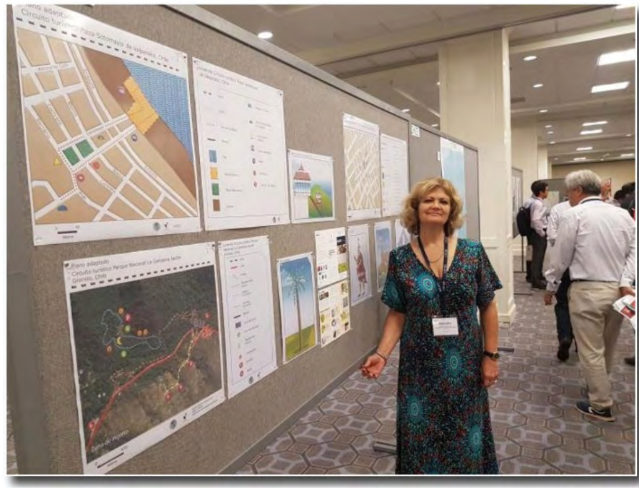
The Commission Chair at the panels with the sheets prepared by the UTEM and displayed in the Cartographic Exhibition.