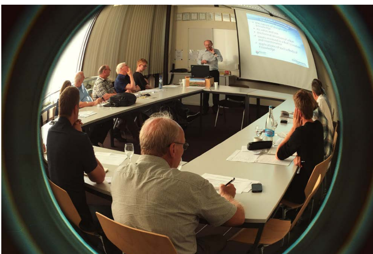
Novel view of Joint meeting with Commission on Atlas Cartography, Zurich, 2016