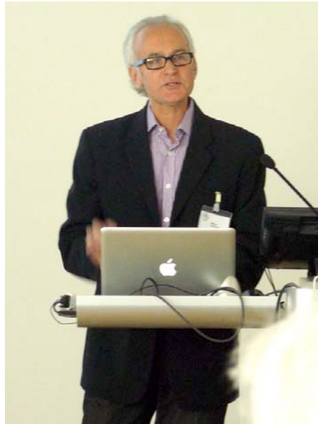
Figure 10. ICA President William Cartwright making the opening address at the 50th anniversary meeting

The symposium provided the occasion to present a ‘snapshot’ of the past and current activities of the Association. This was done through formal presentations. The presenters at the symposium were: