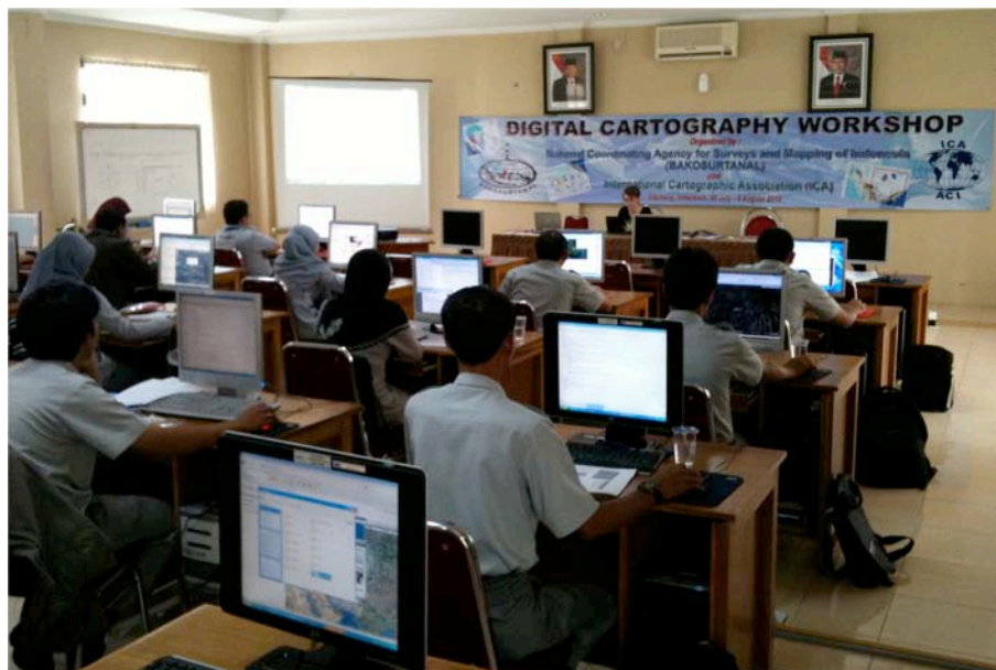
Figure 15. ICA Commission on Education and Training, in collaboration with Bakosortonal, Workshop on Web 2.0 and Cartography - Jakarta, 2010

As well, at each ICA conference the Association makes available Travel Awards for young scientists to attend and present. In 2009 seven awards were made for travel to the ICA conference in Santiago, Chile. Young scientists from Ukraine, China, Poland, Chile, Brazil, Argentina and Senegal attended the conference and presented papers under this scheme.