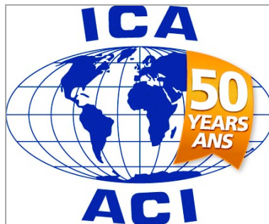
Figure 12. International Cartographic Association 50th Anniversary logo