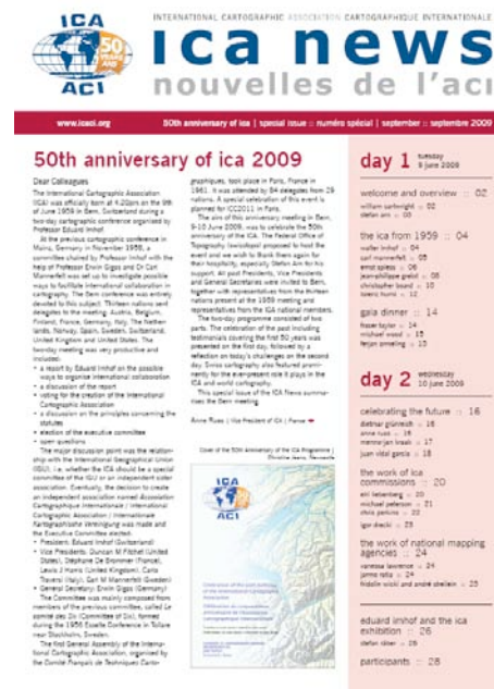
Figure 5. ICA News special issue produced to commemorate the 50th anniversary of ICA in 2009