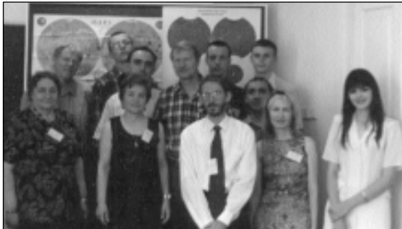
Some participants of the Intercarto IX conference.