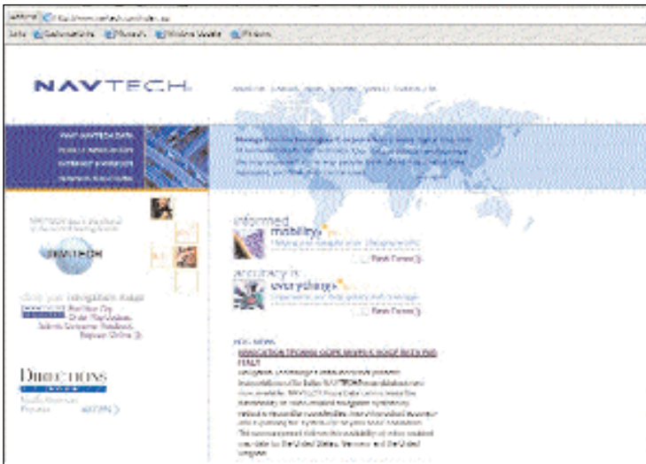
Navigation Technologies Corporation: www.navtech.com