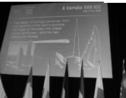
Presentation of the video promoting the XXII ICC at A Coruña.