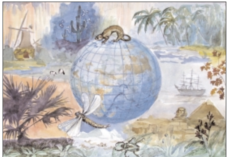
Russian Federation (ru2): Cherish our nature (refer page 7)