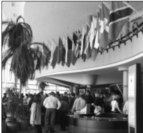
One of the many opportunities to network during the coffee breaks