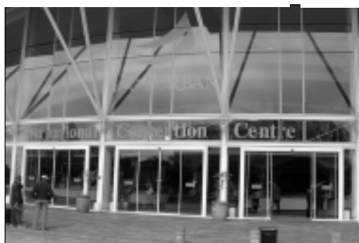
The International Convention Centre, Durban, venue of the 21st ICC and 12th ICA General Assembly