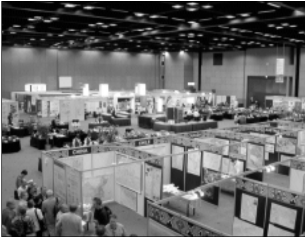
ICC map exhibition area, which boasted in excess of 1,000 entries from 34 countries.