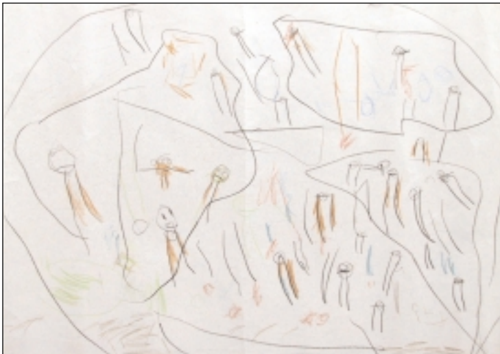
Brazil (bl5): Human beings, signs of equality (refer page 7)