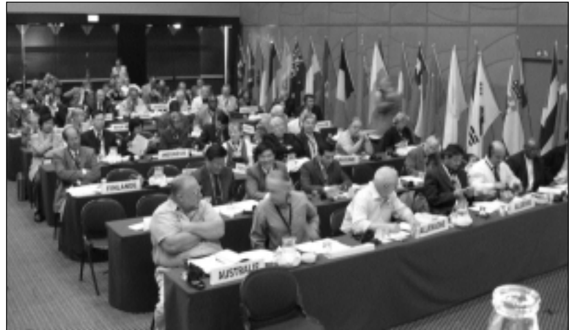
Deliberation of country members during the XII ICA General Assembly.