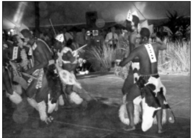
Traditional Dancers at the 'Africa Fun Night'