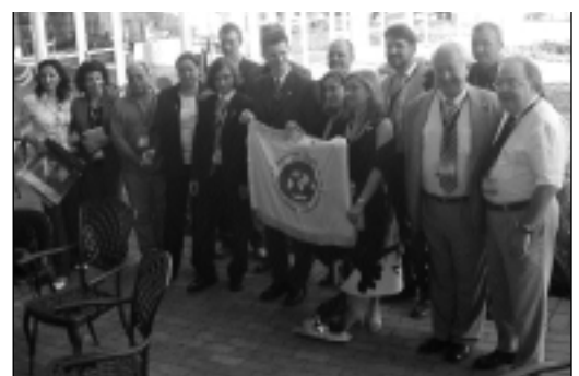
The ICA flag in the hands of the Spanish LOC for ICC2005, and the Russian LOC for ICC 2007.