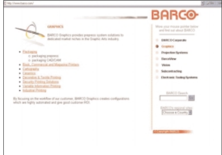
Barco Graphics: www.barco.com