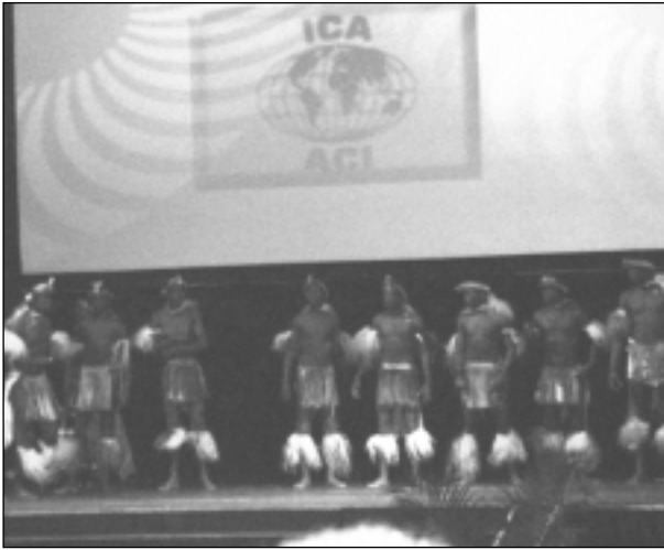
Traditional African dancers entertained the guest speakers and delegates at the opening ceremony.