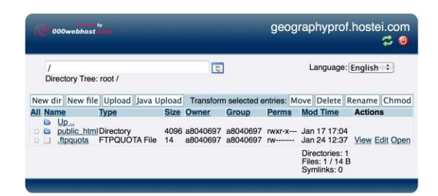
Figure 14.3 shows the File Manager Window from an online hosting service. This service allows files to be created and edited. All files to be served through the web must be in the public_html directory/folder. (© 2014 First Class Web Hosting)

Figure 14.2 shows a standard webHosting control panel, called cPanel, which gives access to different tools. File Manager is the major program for uploading and editing files. (© 2014 First Class Web Hosting)