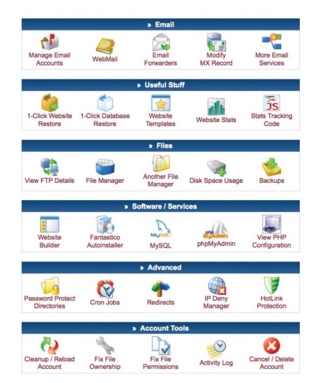
Figure 14.2 shows a standard webHosting control panel, called cPanel, which gives access to different tools. File Manager is the major program for uploading and editing files. (© 2014 First Class Web Hosting)

http://geographyprof.hostei.com/Online _Mapping/index.htm