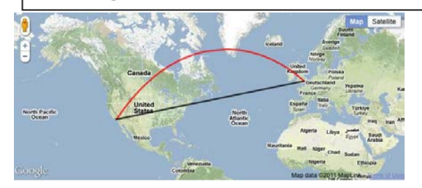
Figure 14.13 shows the geodesic: true polyline option connecting two points through the great circle, the shortest distance between two locations on the sphere. It appears as a longer line on this map because of the projection.

var flightPlanCoordinates = [ new google.maps.LatLng(37.772323, 122.214897), new google.maps.LatLng(21.291982, 157.821856), new google.maps.LatLng(-18.142599, 178.431), new google.maps.LatLng(-27.46758, 153.027892) ]; var flightPath = new google.maps.Polyline({ path: flightPlanCoordinates, strokeColor: "#FF0000", strokeWeight: 3