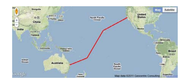
Figure 14.12 shows a line made from three elements consisting of four points.

The google maps Polyline function is used to draw lines with the Google Maps API. In Figure 14.12, the Polyline function connects points that have been previously defined. Options for controlling the appearance of the line include strokeColor, strokeOpacity, and strokeWeight. As always, an appropriate center and zoom level must also be defined. The center could be the midpoint of the line itself.