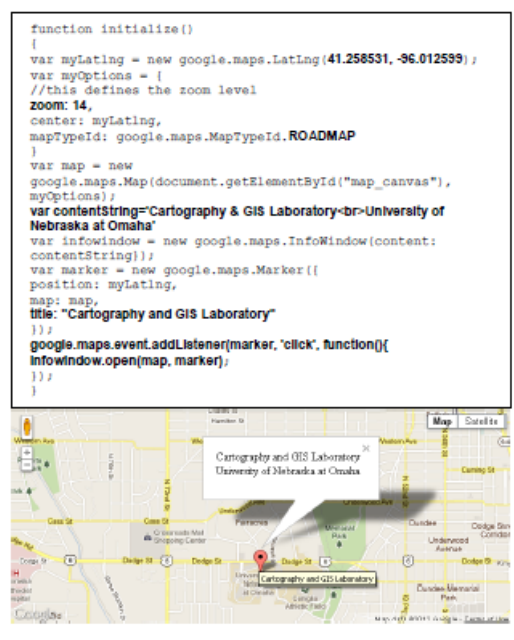
Figure 14.10 shows an example of a clickable marker. The contentString text variable is defined in HTML.

The default Google marker is an upside-down raindrop symbol, but a large number of alternative icons are available. It is even possible to design symbols because they are simply 32x32 pixel images in the PNG format. Markers can be static or interactive. The major interactive type of marker is one that is clickable.